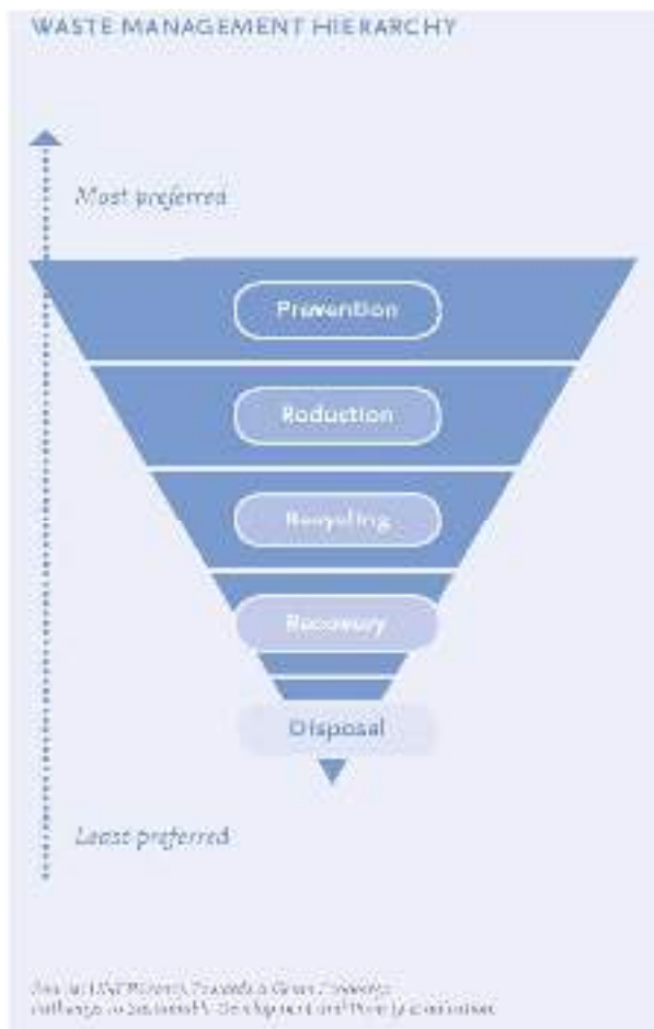
Figure 2: Waste Management Hierarchy

iii) rest on a base of sound institutions and pro-active policies